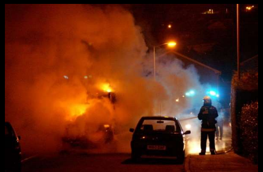
Photography Group Silhouettes